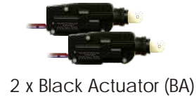
2 x Black Actuator (BA)